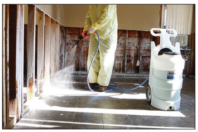
Figure 2. Pump-up or motorized foam generators can apply a wide range of cleaning chemicals

While bleach is convenient as a cleaner and stain remover for hard, non-porous items, it has distinct drawbacks when cleaning floodimpacted buildings. Many types of bleach are not EPA-registered as a disinfectant. Further, its effectiveness in killing bacteria and mold is significantly reduced when it comes in contact with residual dirt, which is often present in flooded homes. Also, if bleach water comes into contact with electrical components and other metal parts of mechanical systems it can cause corrosion. Bleach water can also compromise the effectiveness of termite treatments in the soil surrounding the building.