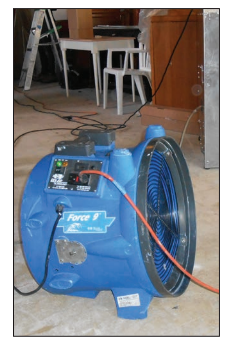
Figure 4: Drying equipment

Once the electrical and HVAC systems have been restored and sanitized, the moisture content of wetted salvageable building materials should be checked to determine whether drying equipment will be necessary (see Figure 5 and Table 1). Drying equipment includes fans, dehumidifiers, air conditioners, and auxiliary electric heaters. Moisture content should be checked using an intrusive/ penetrating (pin-type) moisture meter (Figure 5) because moisture content is difficult to assess accurately using only touch or sight. The materials must be rechecked after drying before doing any rebuilding. Wetted materials are presumed to be dry when their moisture content is less than or equal to 15 percent (Table 1).