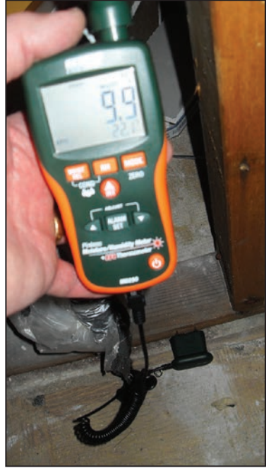
Figure 5: Use of a penetrating (pin-type) moisture meter to verify that wood frame has a water content of less than 15 percent