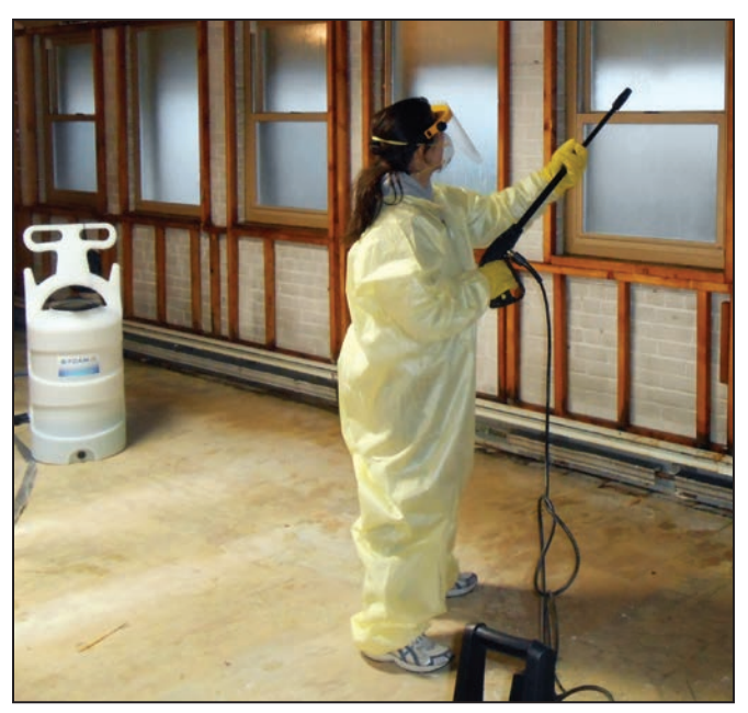
Figure 3. Using a pressure washer to rinse surfaces cleaned with a foam solution